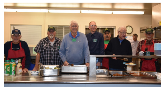
An always scrumptious dinner is prepared thanks to the amazing culinary skills of the Knights of Columbus.

Saint Joseph Community Land Trust would like to thank the community for helping us celebrate another successful year at our Annual Spaghetti Dinner in November at Saint Theresa's Grace Hall. Special thanks goes to the Knights of Columbus, Council 10611/St. Theresa and their exemplary chefs who provided the delicious meal. We would also like to thank Crazy Good Bakery, Lake Tahoe AleWorx and Tahoe Pourhouse for their donation of raffle prizes. Thank you also to several who became new members of the Land Trust and to all who participated in the evening.