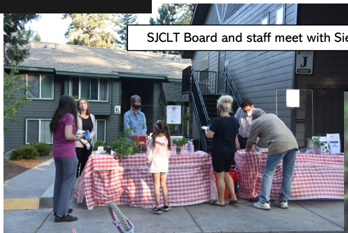
SJCLT Board and staff meet with Sierra Garden tenants at recent Pizza & Pop event