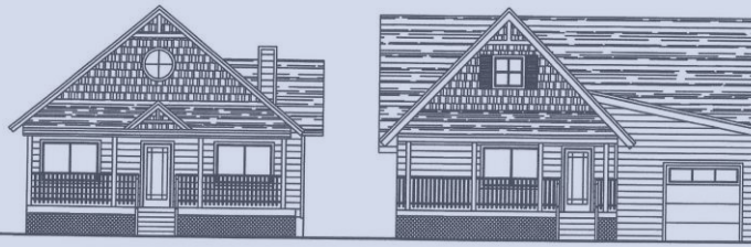
San Jose Avenue Street View

SJCLT Moving forward with development of 3 affordable ownership homes on Riverside Avenue between San Jose and Alameda in South Lake Tahoe